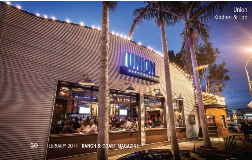
Union Kitchen & Tap