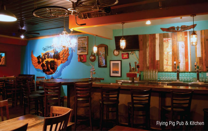
Flying Pig Pub & Kitchen